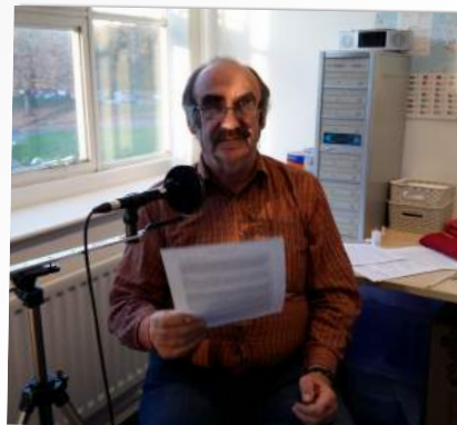
RECORDING IN OUR OFFICE