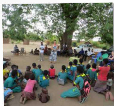
VILLAGE IN MALAWI