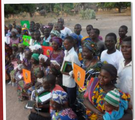
FLIP CHARTS IN CHAD