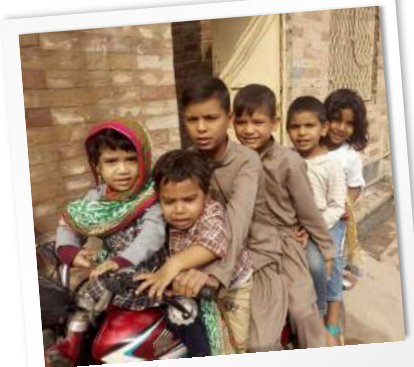
MOVE UP A BIT!