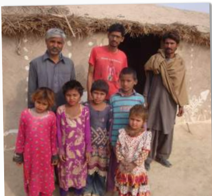
FAMILY IN PAKISTAN